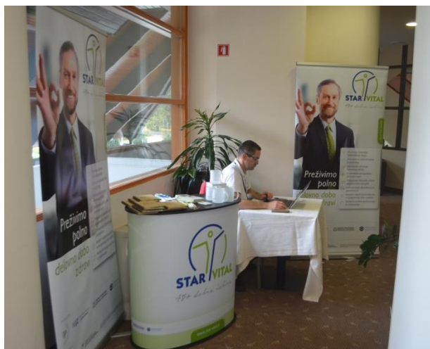
Project Star Vital