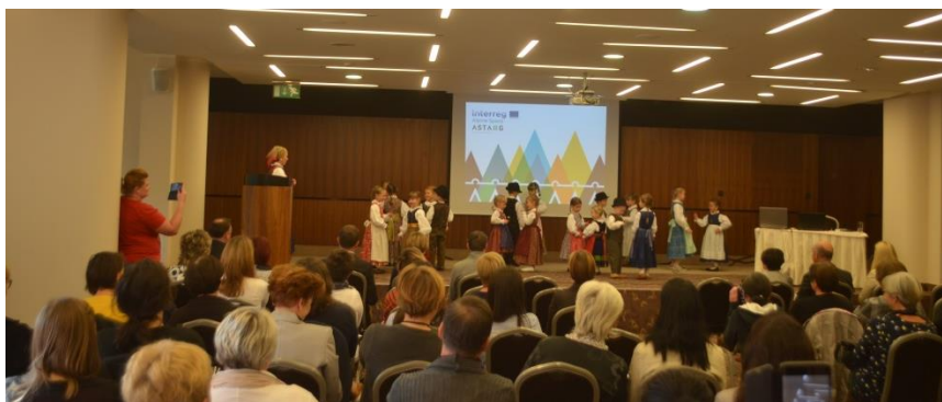
Picture 1: Conference opening