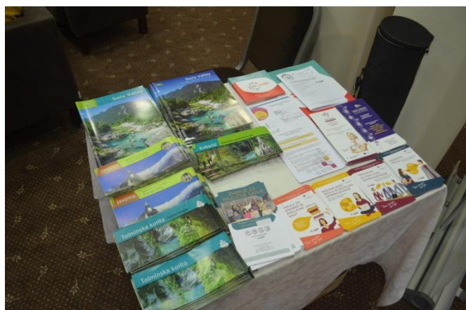
Soča Valley Development Centre