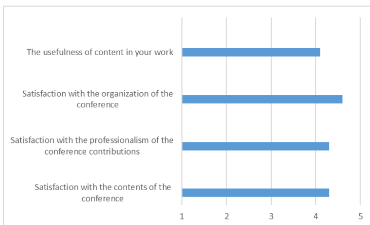
One of the results: Question regarding overall conference satisfaction average response (1-5)