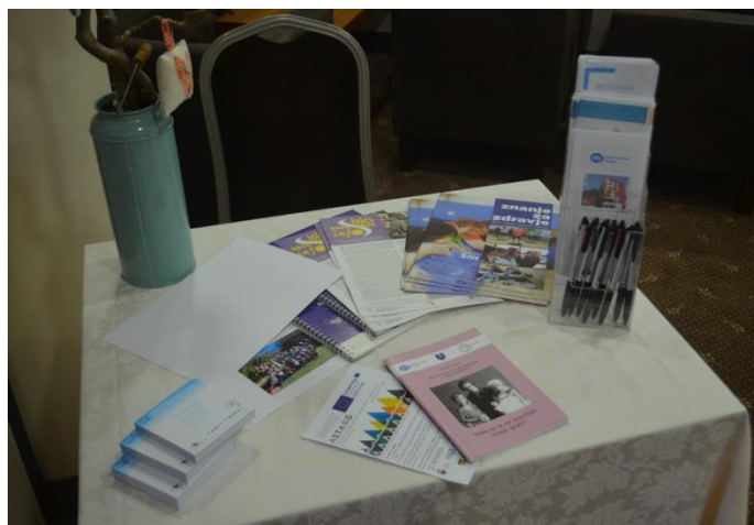
University of the Third Age Jesenice